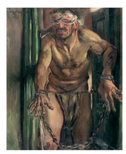
Corinth, The Blinded Samson (1912, Nationalgalerie, Berlin).

With regards to the structure, the book is divided into three sections: in Part 1, Exum outlines her approach in her introductory chapter 'Visual Criticism'. This is followed by a chapter, intriguingly sub-titled 'Paintings that changed my mind' in which she explains how a work of art (she uses Corinth's Blinded Samson and Moreau's Scene from the Song of Songs as examples) can influence one's long-held views on biblical texts whose meaning can appear ambiguous. Part 2