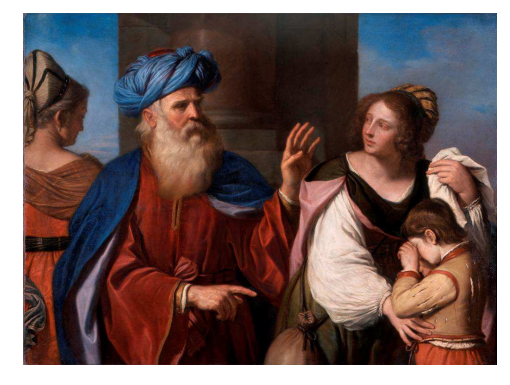
Guercino, Abraham Casting Out Hagar and Ishmael (1657, Pinacoteca di Brera, Milan).