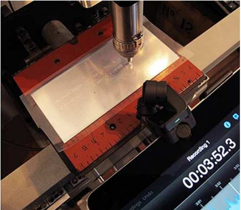
Fig. 2: Matrix engraving of the second commandment in English (left) and Welsh (right), 2010 and 2015.

In translating the texts into sonic samples, three different methods of engraving were addressed. In the first, each version of the verse was mechanically inscribed in English and Welsh on an aluminium plate (evoking, incidentally, the two tables of the law) by commercial engraving machines, and the sound of the process captured digitally (Fig. 2). Slowed-down versions of the recordings were then modified through a network of analogue and digital synthesizer filters in order to generate tonal characteristics appropriate to the general mood of the narrative – which is one of threat, awe, and gloom, for the most part.