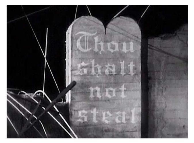
Fig. 6: C.B. DeMille, The Ten Commandments, 1923.

lapses on and fatally wounds her. God's collapses on and fatally wounds her. God's judgement on the son's avarice appears on the one architectural ornament that has survived the calamity. The tables of stone described in the Exodus narrative are, in the film, converted into concrete slabs (Exod 24:12; Fig. 6). Likewise, the commandment's inscription is reconceived as a projection upon them. (God communicated