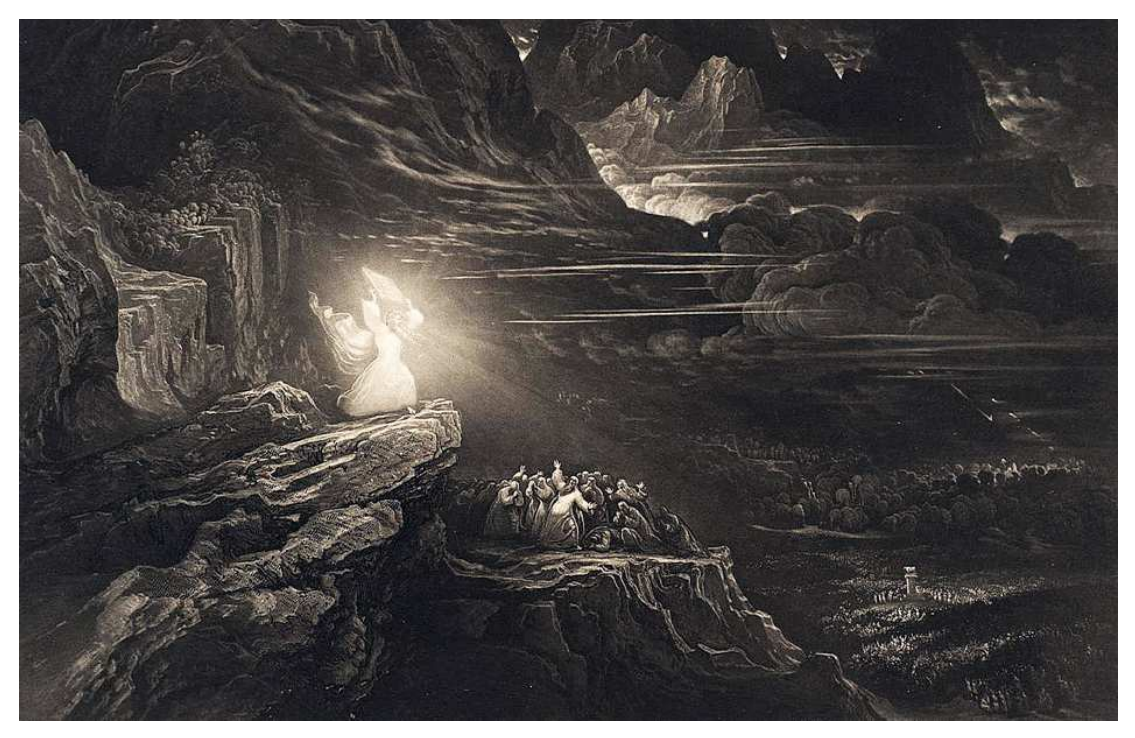
Fig. 3: J. Martin, Moses Breaketh the Tables, from: Illustrations to the Bible, mezzotint, 1883.

databending technique, by sound-editing software.<sup>17</sup> Thus, the source text, having been translated through three distinct processes, converged as a single medium or state: digital sound. The resultant three sonifications, and only these, became the substance of 11 scenes descriptive of the narrative – scenes in the sense of not only a sequence of events or actions (such as one might encounter in an opera or a play) but also prospects or views (as in the tradition of land-scape art):