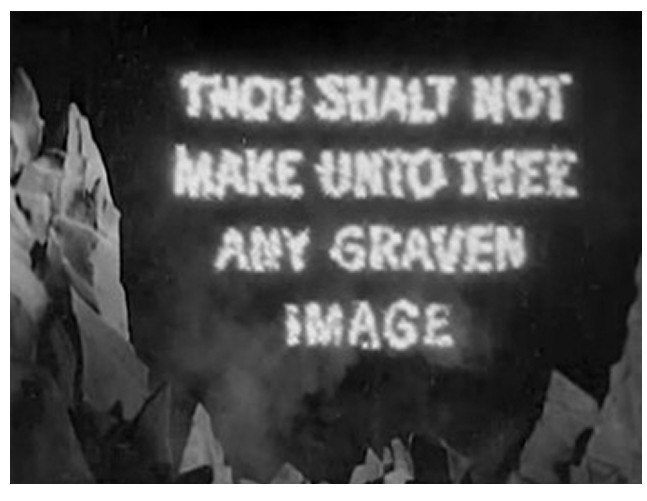
Fig. 4: C.B. DeMille, The Ten Commandments, 1923.

(1832–1883), and to the colouration of Lawrence Alma-Tadema (1836–1912). The earlier film's silence is quelled by the accompanying music, but only in part. Speech remains mute; it can be made visible only as text on caption boards. Likewise, the ambient sounds described in the source are rendered either as an illuminated text or, in the scene in which Moses's received the Ten Commandments, onomatopoeically, by the instru-